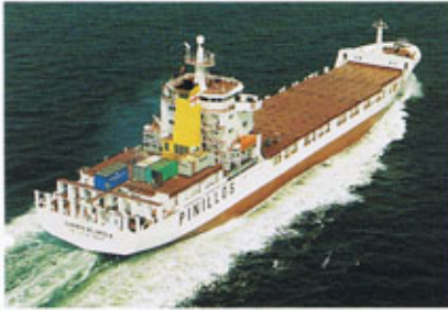
The porthole containers are located in the hold behind the deckhouse.