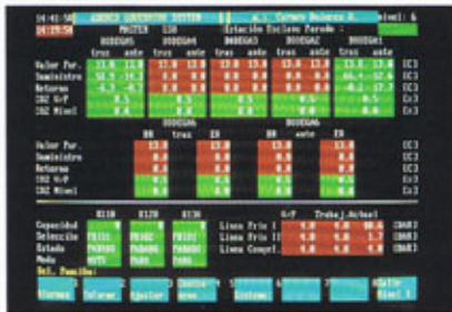
19" Colour screen for monitoring and control of the refrigerating plant.