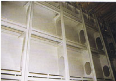
Air slots to blow air under the pallets.